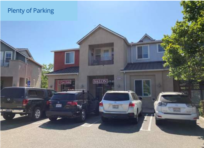
Plenty of Parking